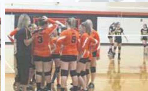
NLMS volleyball players break for a few minutes to plan their strategy.