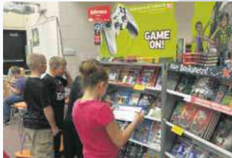
Students browse the book fair selections and make their selections. Proceeds from the book fair come to us in the form of product. We enjoy a selection of books from Scholastic for our libraries.